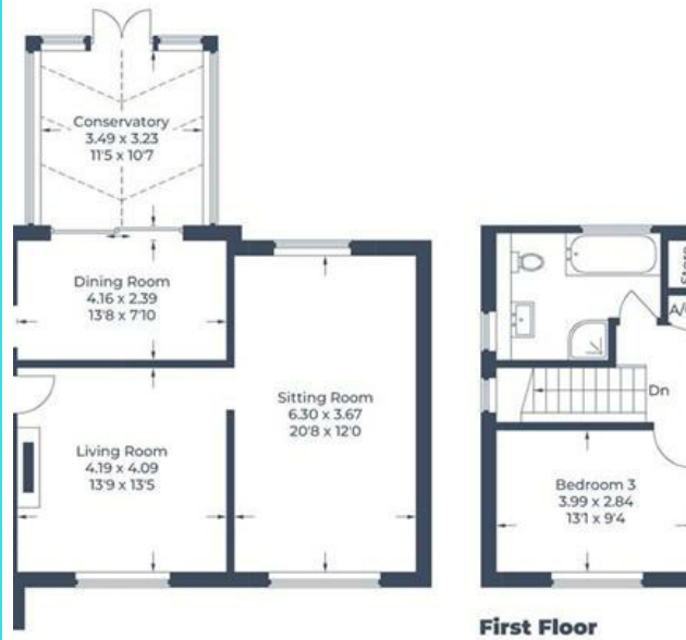
Illustration for identification purposes only, measurements are approximate, not to scale. © CJ Property Marketing Produced for Fine Homes Property

Approximate Gross Internal Area Ground Floor = 94.2 sq m / 1,014 sq ft First Floor = 80.5 sq m / 866 sq ft Outbuildings = 23.1 sq m / 249 sq ft Total = 197.8 sq m / 2,129 sq ft (Including Garage)